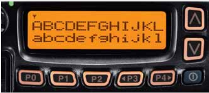
Two line setting display example.

With a high contrast dot matrix display, upper and lower case characters can be easily distinguished. You can change the display setting to show one line and 12 characters, or two lines and 24 characters via programming. LCD backlighting is standard.