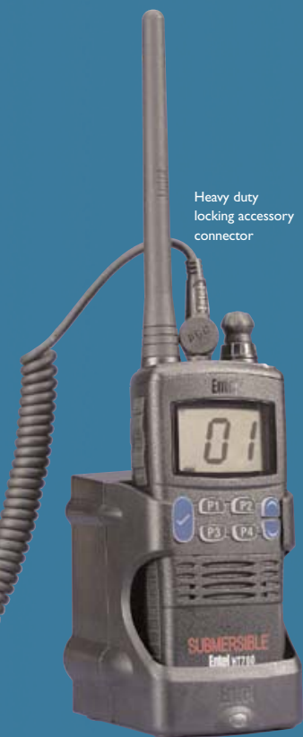
Heavy duty locking accessory connector