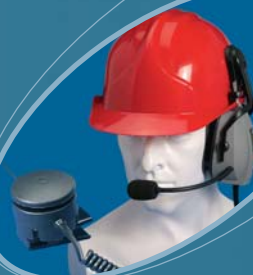
CHP640HS shown with optional large PPT button