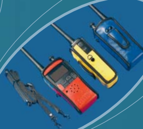
CFC640 red, yellow and blue