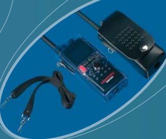
CLC640 and CLC940