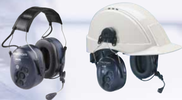
Attenuation headband, weight: 368 g